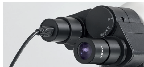
Eyepiece camera fixed into the tube