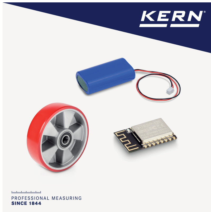
Carte mère REWN820-1-01