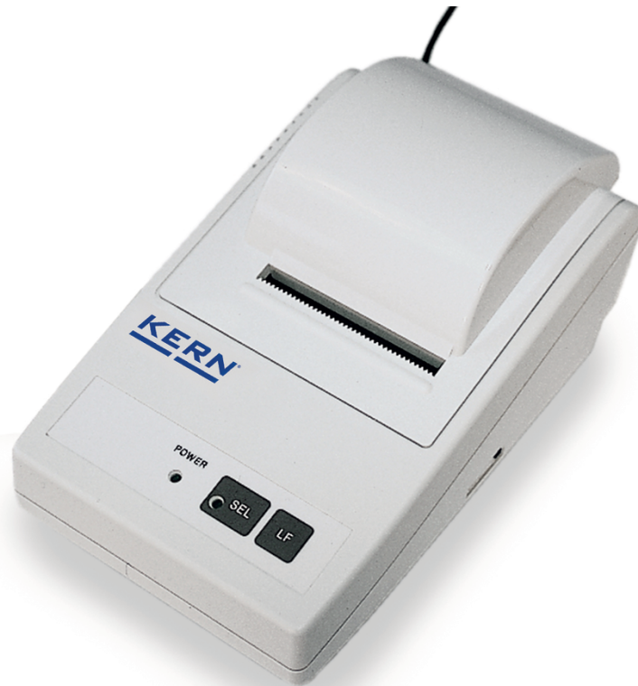
Matrix needle printer