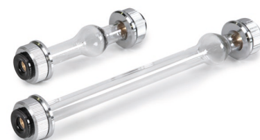
Cuvette 100mm and 200mm