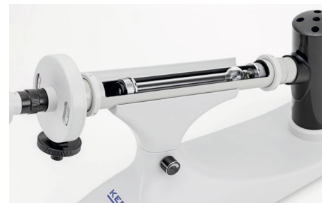
Cuvette in measuring chamber