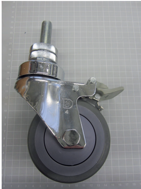
wheel, with brake